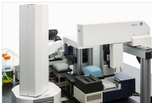
Synthetic Biology Workstation