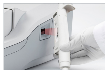
2. Scan pipette