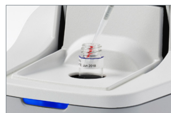
4. Dispense samples