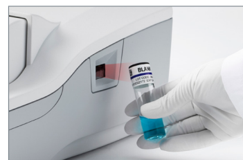
3. Scan calibration solutions