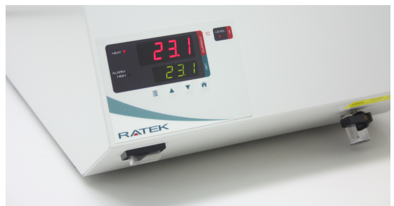
Simple operation with large bright dual-line display and informative LEDs

The tank is constructed from a single piece of food grade stainless steel with seamless corners making cleaning a breeze. All baths are supplied with a removable stainless steel guard that protects the user from the heating element whilst giving a sturdy platform to work on. All models also feature an adjustable drain tap conveniently located to sit beyond the edge of the bench for simple and safe emptying of the bath. Ratek's most advanced water baths to date offer simplicity with performance and can be run day in day out.